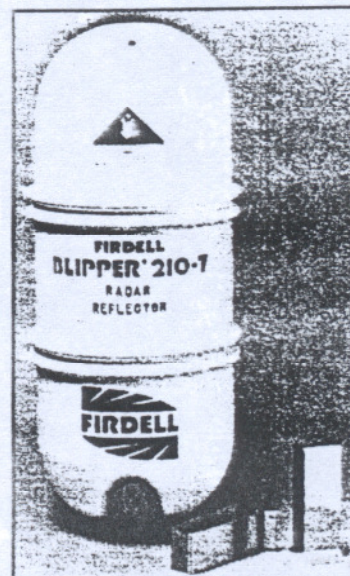
Blipper 210-7 with stainless steel 'yachtmast' mounting brackets

It is available in white, orange, red, green, yellow, and black. Other colours to requirement.